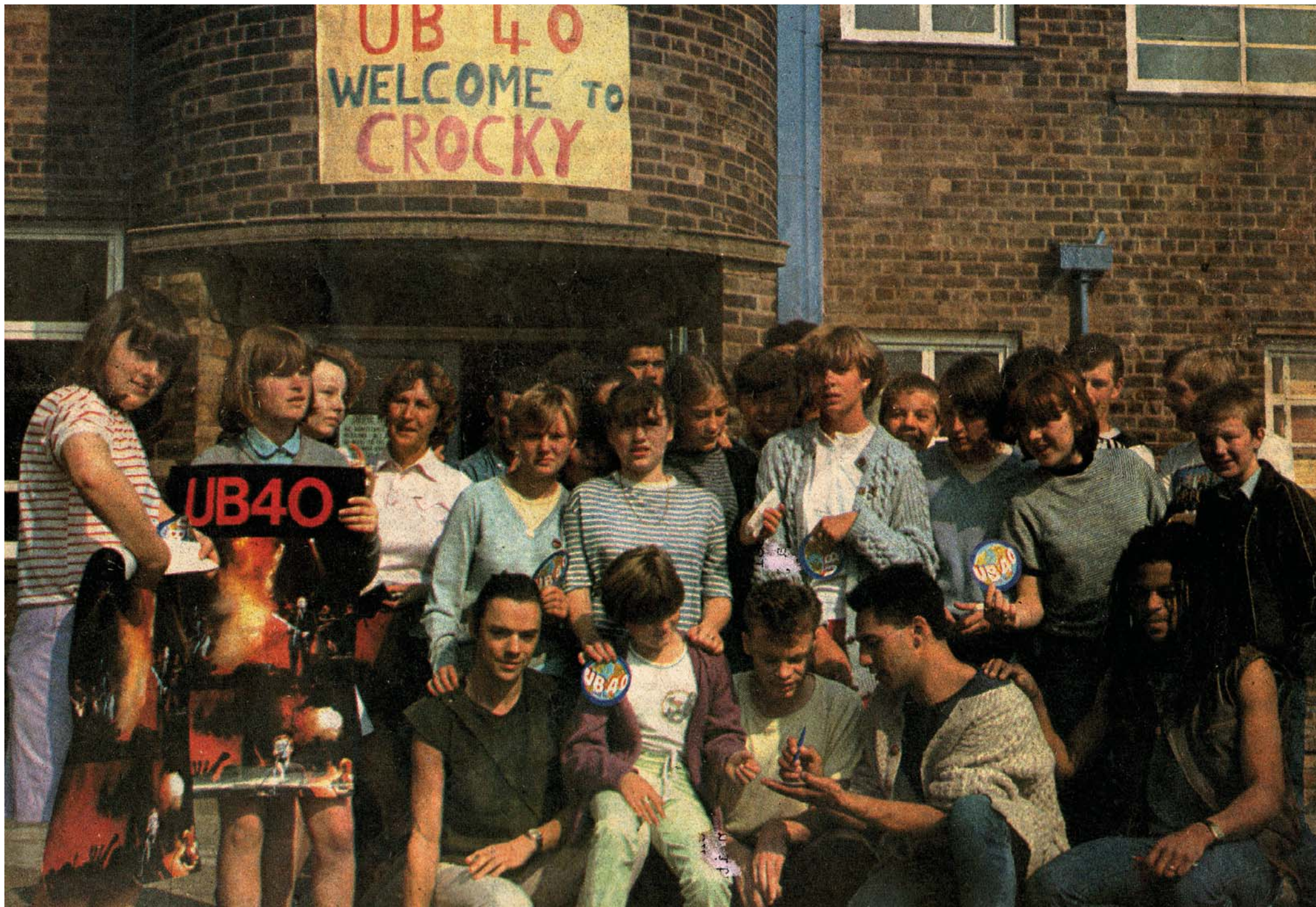
Welcome to Crocky - the community took over Croxteth Comprehensive School in the summer of 1982 (Nerve 4)