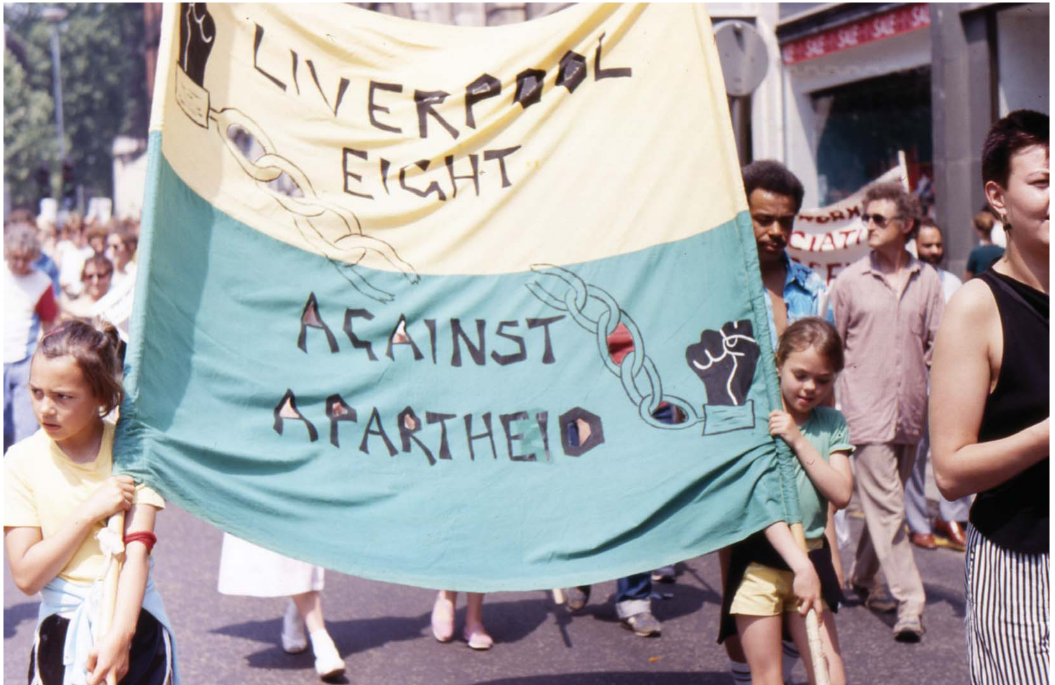
Amandla! - Liverpool 8 joins national anti-apartheid march, June 1984