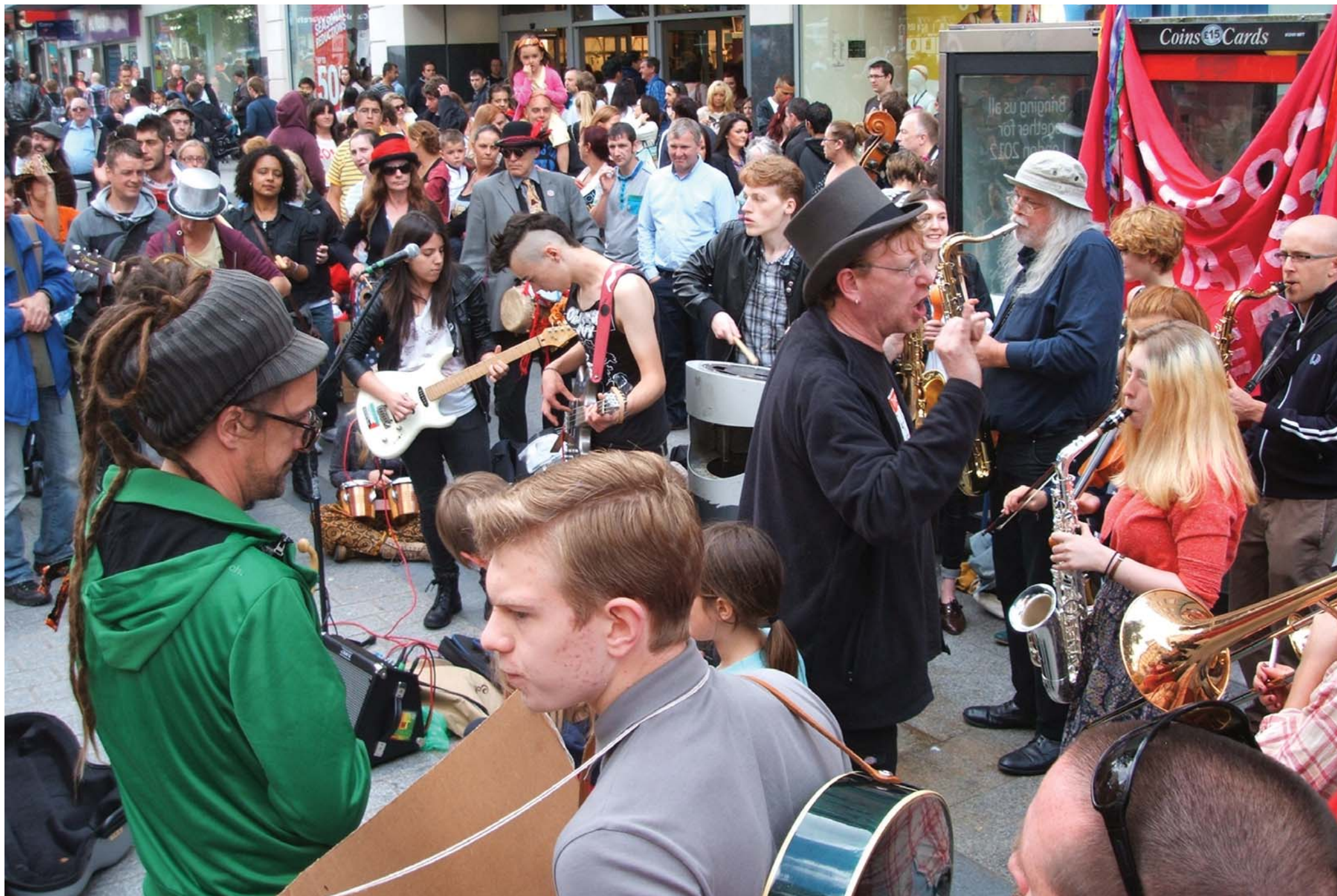
Buskers' Revenge 2011 - A mass turnout of musicians puts paid to the City Council's latest attempt to kill off street entertainment (Nerve 20)