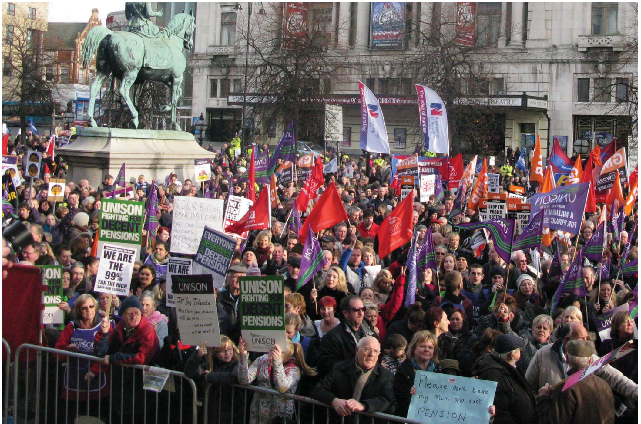
Arise ye starvelings from your slumbers - Marchers at St George's Hall in one-day public sector strike, 30 November 2011