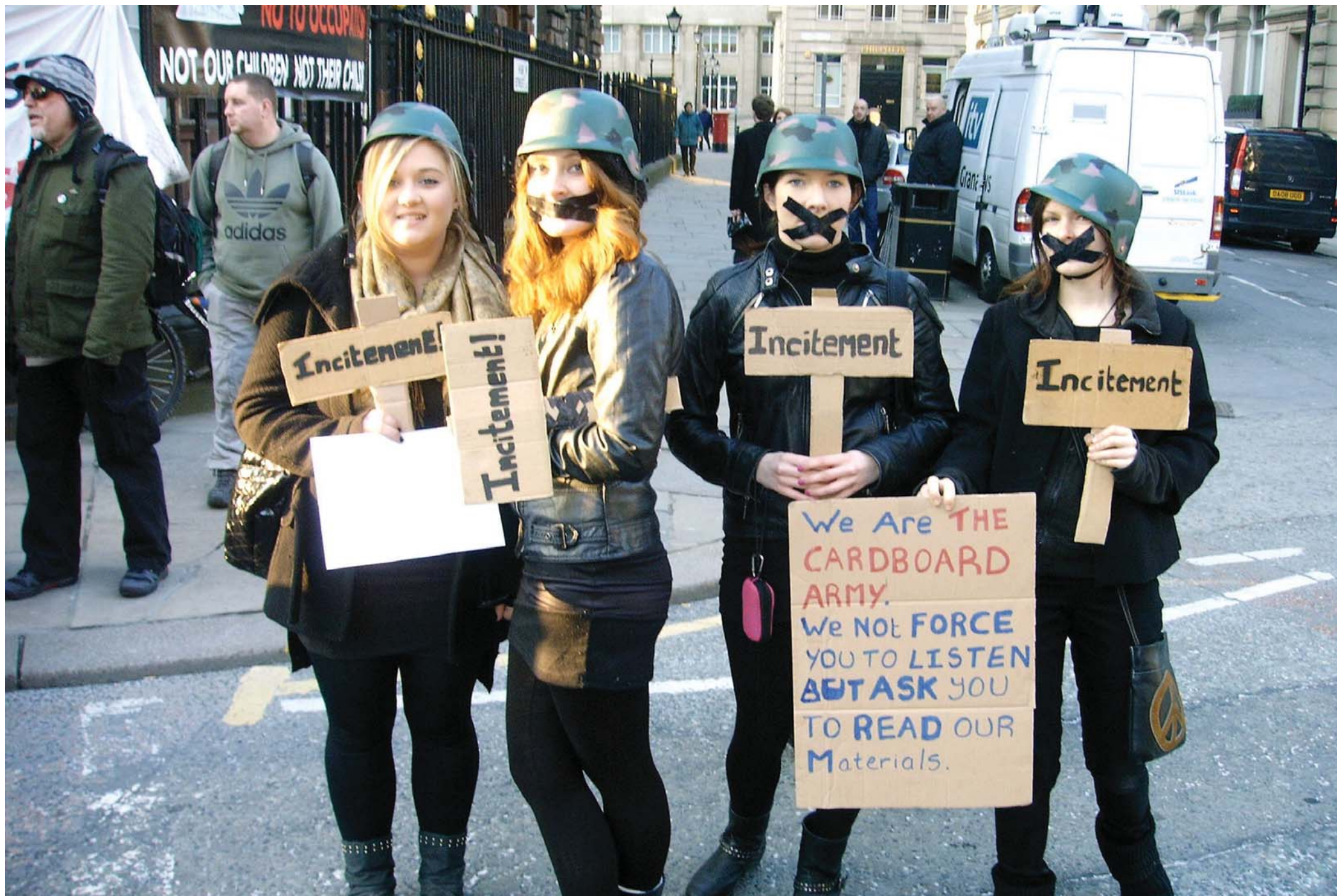
We Are the Cardboard Army - Anti-cuts protesters on one of many protests outside Liverpool Town Hall (Nerve website)