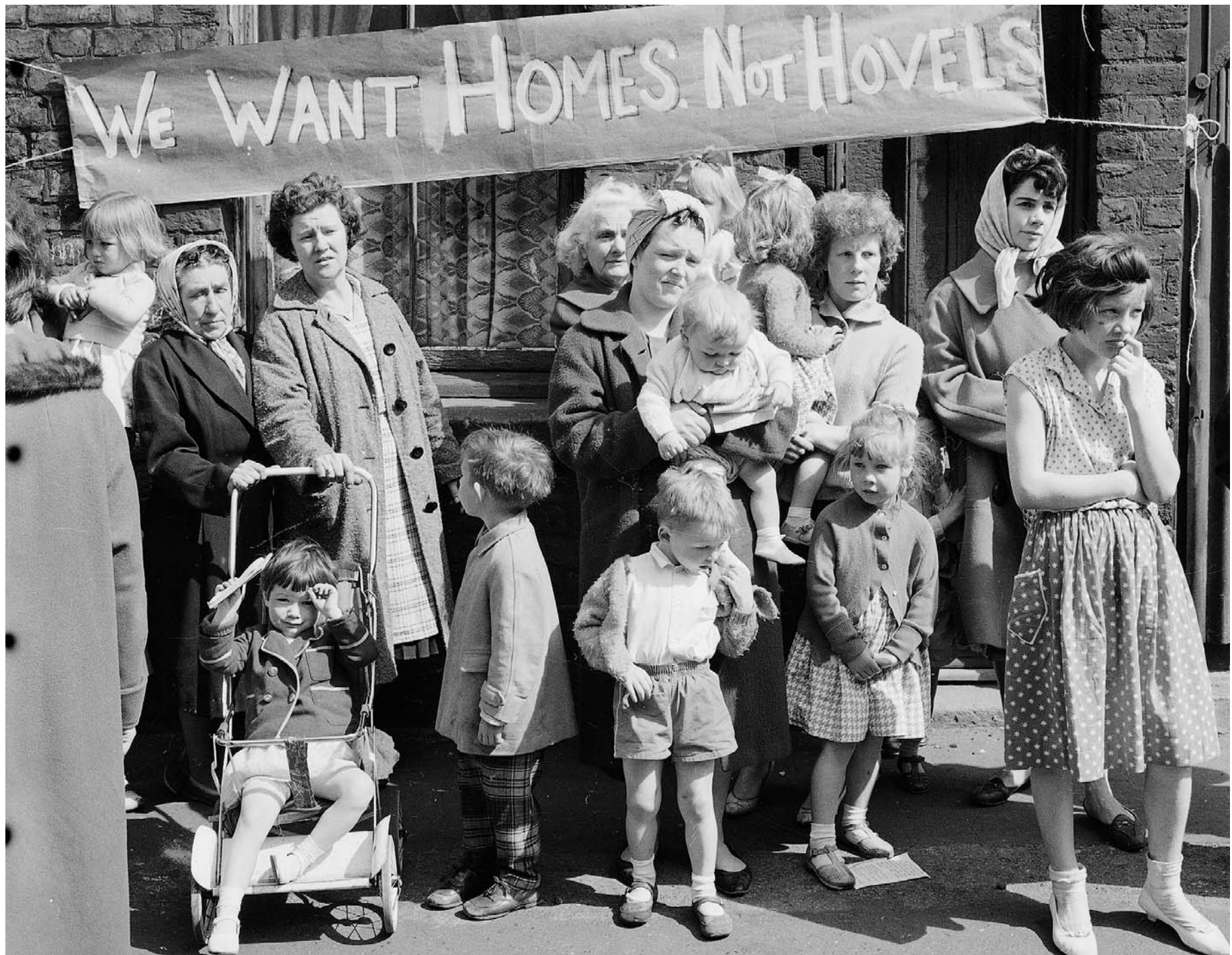
We Want Homes Not Hovels - Council tenants of the late 1960s protest against housing conditions (Nerve 15)