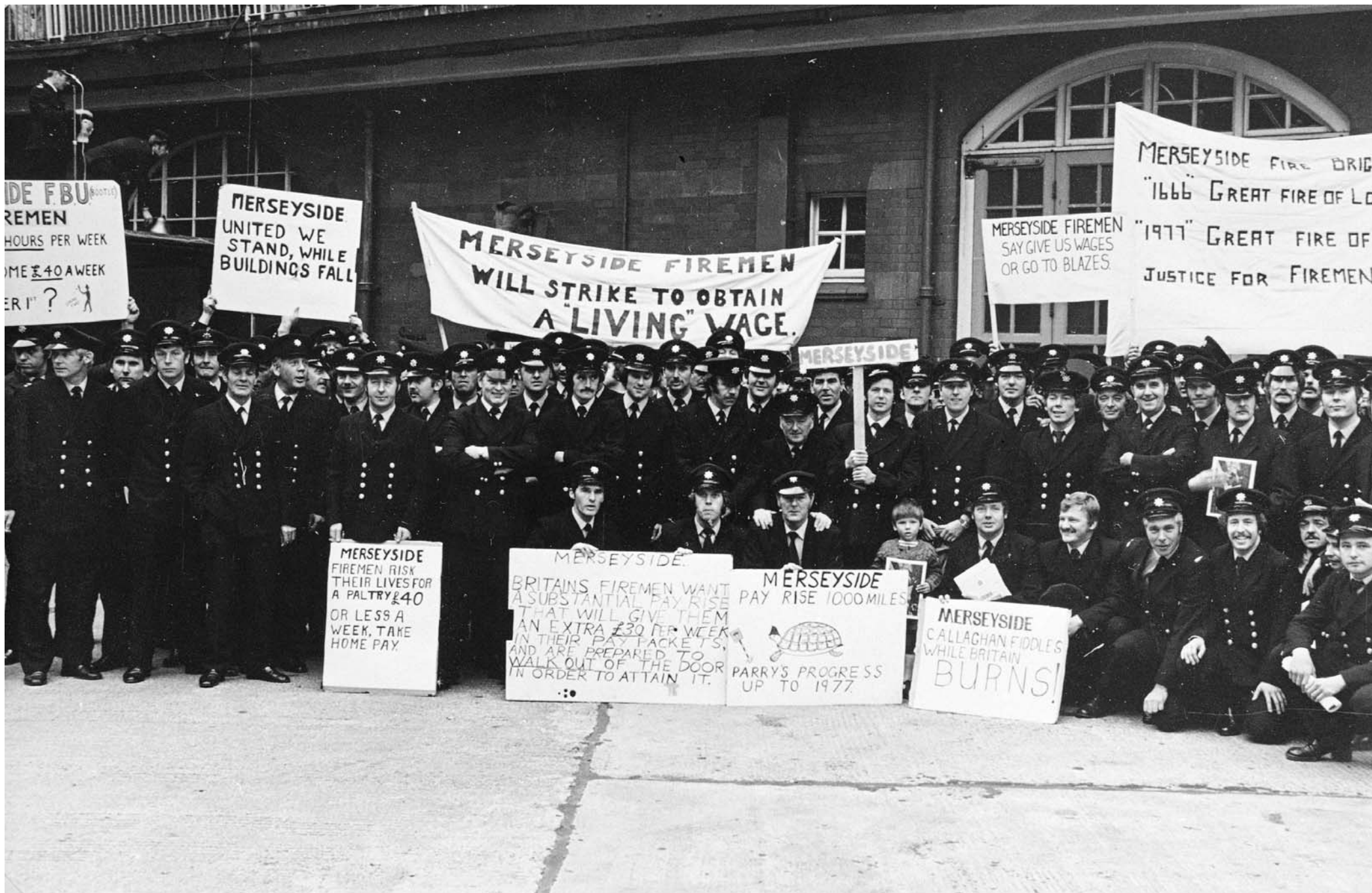
Striving for a living wage - firefighters on strike in 1977