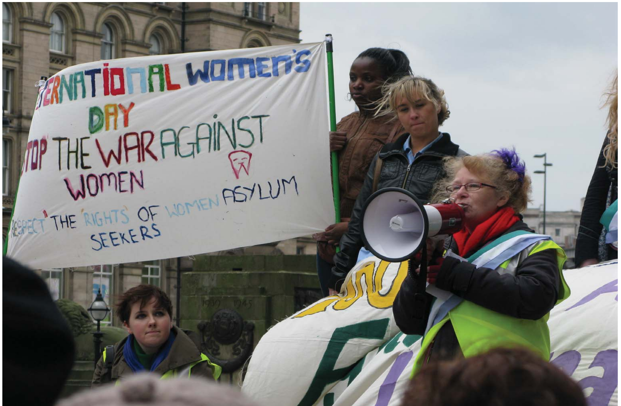
International Women's Day - first celebrated in 1911. The march and rally of 2011 continues the tradition of resistance (Nerve website)