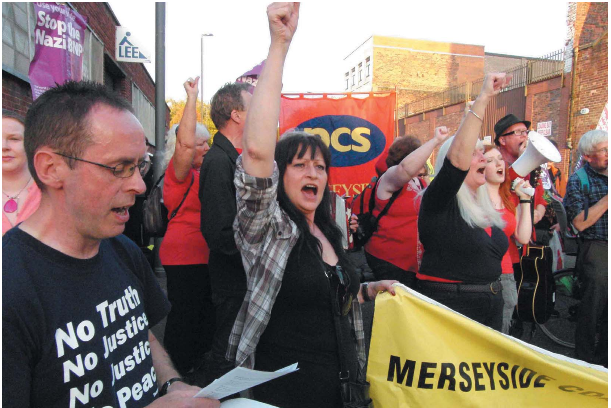
They shall not pass - A mass turnout sees off the BNP's attempt to picket Question Time, 29 Sept 2011 (Nerve 18)