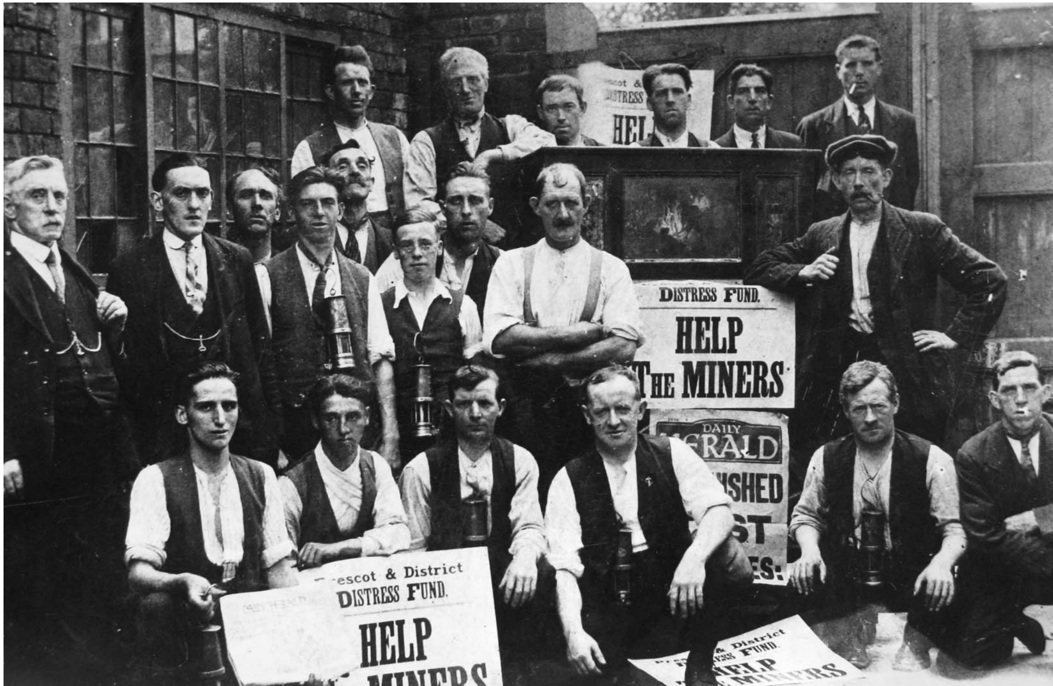
1926 Miners strike support group (Nerve 9)